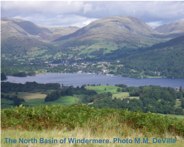
The North Basin of Windermere.

Lakes are sensitive to multiple human pressures that operate at different spatial and temporal scales and trigger a variety of interlinked, often negative, consequences for freshwater ecology and the benefits that lake ecosystems provide. Like all lakes, the state of Windermere has altered over time. Over several centuries, human activities caused nutrient-enrichment. More recently, climate change and altered food webs have made Windermere more sensitive to nutrient enrichment, requiring further action to improve its health.